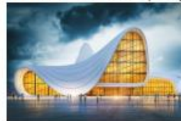
Zaha Hadid – Architecture / design