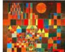
Paul Klee – Abstract cityscapes