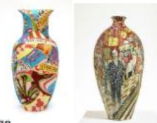
Grayson Perry – Ceramics – Modern techniques compared to Roman vessels