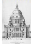
Sir Christopher Wren – Architecture of London – Great Fire of London Compare with contemporary architects