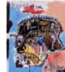
Jean-Michel Basquiat – Compare to Leonardo da Vinci - skeletons