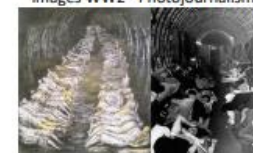
Henry Moore & Bill Brandt – sketchbook images WW2 - Photojournalism