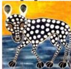
Edward Tingatinga – Tanzanian Art