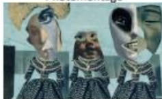
Hannah Hoch – Collage and Photomontage